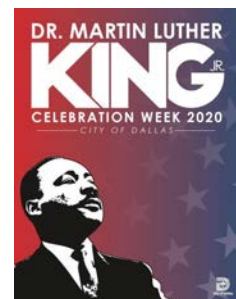
The poster is for the City of Dallas, Texas MLK scholarship essay contest.