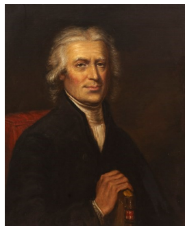
A portrait of Francis Asbury