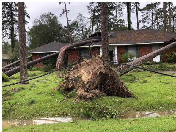
"Hurricane Ida impacts Tangipahoa Parish" from The Daily Star, Hammond, LA

Second, the results from the pre-Thanksgiving Bake Sale on Sunday, November 21. As of that evening $2,728 had been raised, an amount that exceeded the amount they raised at the last fall bake sale in 2019. And more money is expected. All these dollars will go to help fund the Cornerstone January Service Trip to Louisiana.