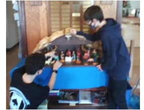
Boys prepare for Christmas

As this Advent season begins, what have you promised yourself about the holidays this year? Are you vowing to have a simpler Christmas? Planning to be available for some activity you love, or time with beloved people? What promises are ahead for your family? Do you know some kids who are waiting eagerly to see what Santa will bring? Adults who are waiting eagerly to collapse and finally get some rest? People who find this time of year hard, and are just hoping to get through it?