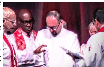
Pastor is Ordained as a full Elder in the UMC.

The Bishop began with some comforting words of faith and hope. We celebrated the life and ministries of retirees, and those that have gone before us. Then, we witnessed the commissioning of the 4 individuals being commissioned for the work of full Elder in the UMC. We also celebrated one person being consecrated as Deaconess, and one person transferring into our Upper NY