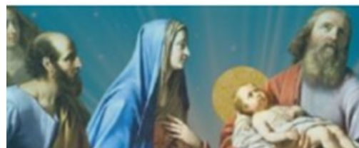
Mary offers us the Flame of Love